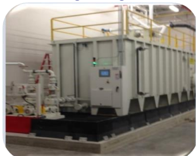
Industrial Waste Tank Skid