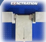
Adjustable Floating Skimmer Head (Patent Pending)