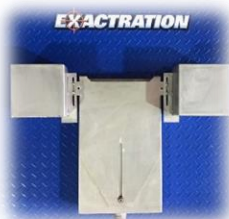
SkimMate™ Patented Adjustable Floating Skimmer