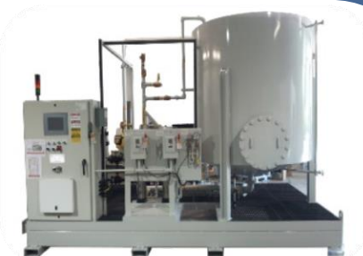
ATF Transfer Skid