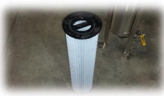
Bag Filter Pleated Elements