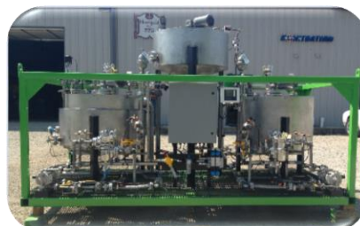
Roll Coater Skid