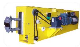
Magnetic Drive Repairs