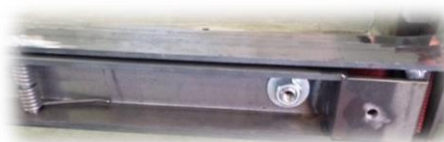
Pressure Filter Side Seals