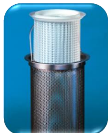
Bag Filter Strainer