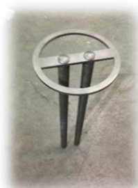
Bag Filter Magnetic Post